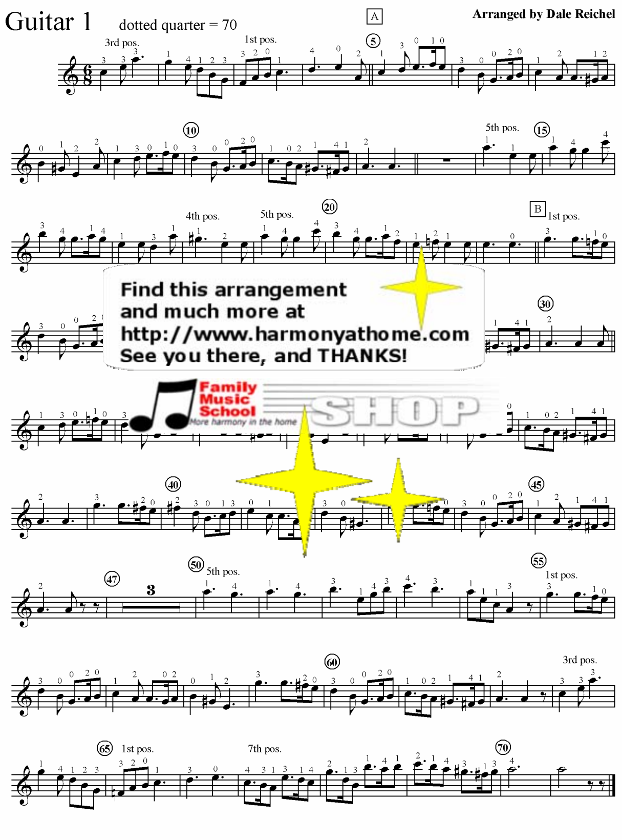
To find this and other arrangements please visit http://www.harmonyathome.com

Notes: Rehearsal A: verse begins Rehearsal B: chorus begins